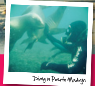
Diving in Puerto Madryn

With our Spanish & Activity programs you will not only be learning Español immersed in a totally Latin atmosphere, you will also be having lots of fun with extra activities. We have an activity for everyone. Check out our courses and sign up for the one you like most!