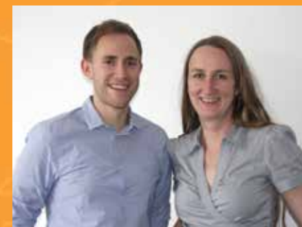
Our office team in Berlin