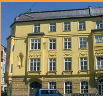
Our school building in Munich