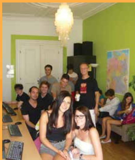
Internet terminals in Munich

Our fully equipped kitchen is a popular hang-out during the breaks and enables an intensive exchange between students and teachers beyond lesson time. Here, extra-curricular activities for the evenings and weekends are planned and these often form the beginning of lasting friendships.