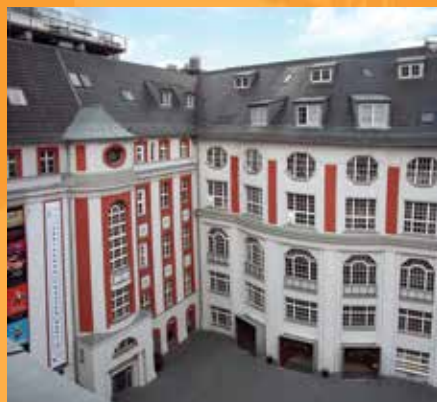
Our school building in Berlin