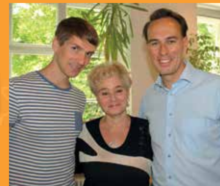
Our office team in Munich

You will be in contact with our office team from the beginning of your first enquiry, up to your booking arrangements until your first day at school. They will be the ones to welcome you and assist you in any matter related to your stay in Germany until it is time to say goodbye on your last day of school when they hand out your language certificate to you. In our offices we do not only speak German but also English, French, Spanish, Italian, Portuguese and Russian - just in case there is something you would prefer to discuss in a language more familiar to you.