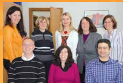
Some of our teachers in Munich

We believe that excellent teaching is the most essential asset to a successful school. Due to continuous further training, our qualified and experienced teachers are well acquainted with the latest developments in the area of German as a foreign language. You will note that our instructors can be seen as highly motivated, very competent and knowledgeable friends who are teaching the class. As a result, the members of our staff are not only available to discuss matters of German language but are also happy to help you with advice on other subjects of life.