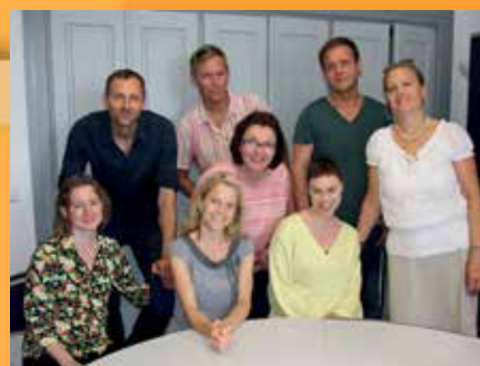
Some of our teachers in Berlin

We believe that excellent teaching is the most essential asset to a successful school. Due to continuous further training, our qualified and experienced teachers are well acquainted with the latest developments in the area of German as a foreign language. You will note that our instructors can be seen as highly motivated, very competent and knowledgeable friends who are teaching the class. As a result, the members of our staff are not only available to discuss matters of German language but are also happy to help you with advice on other subjects of life.