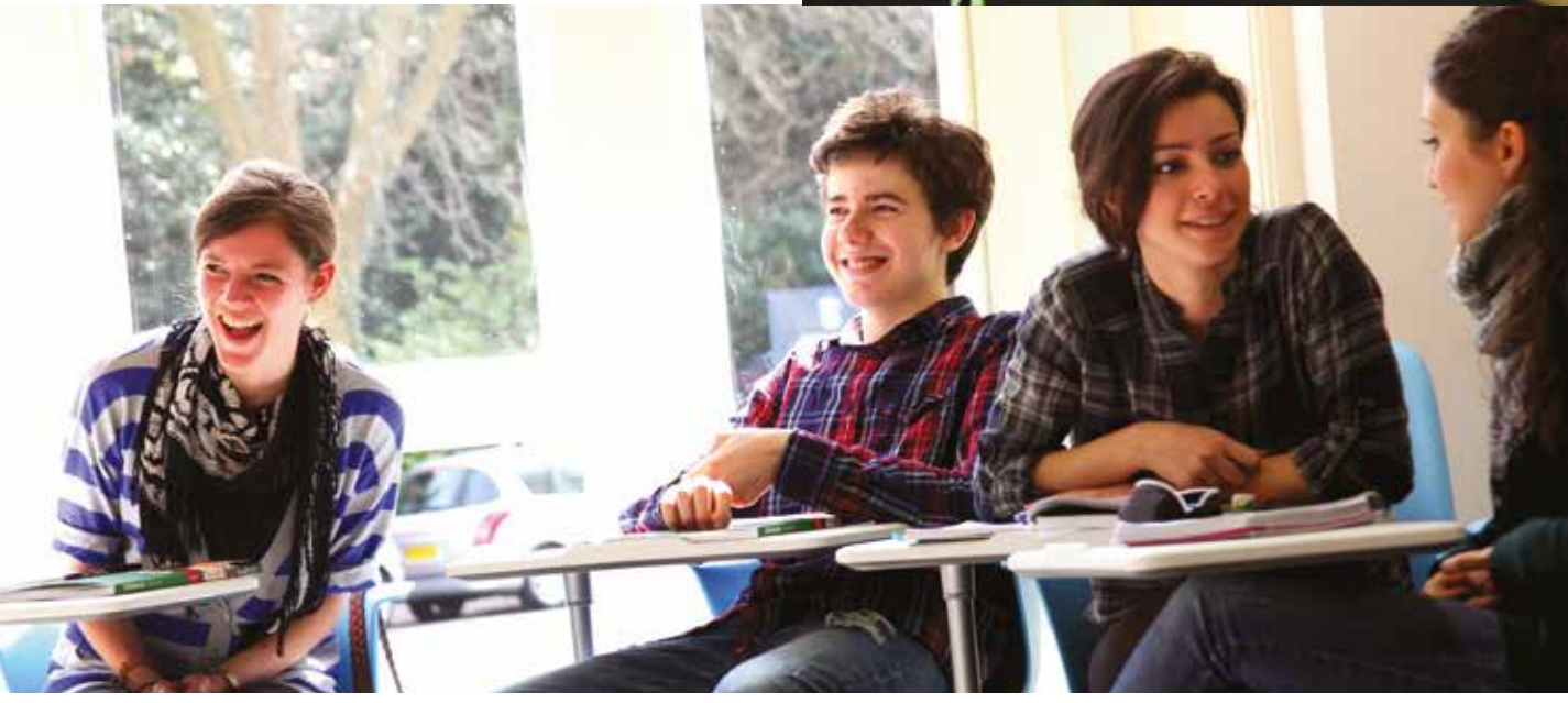
*Minimum student numbers apply